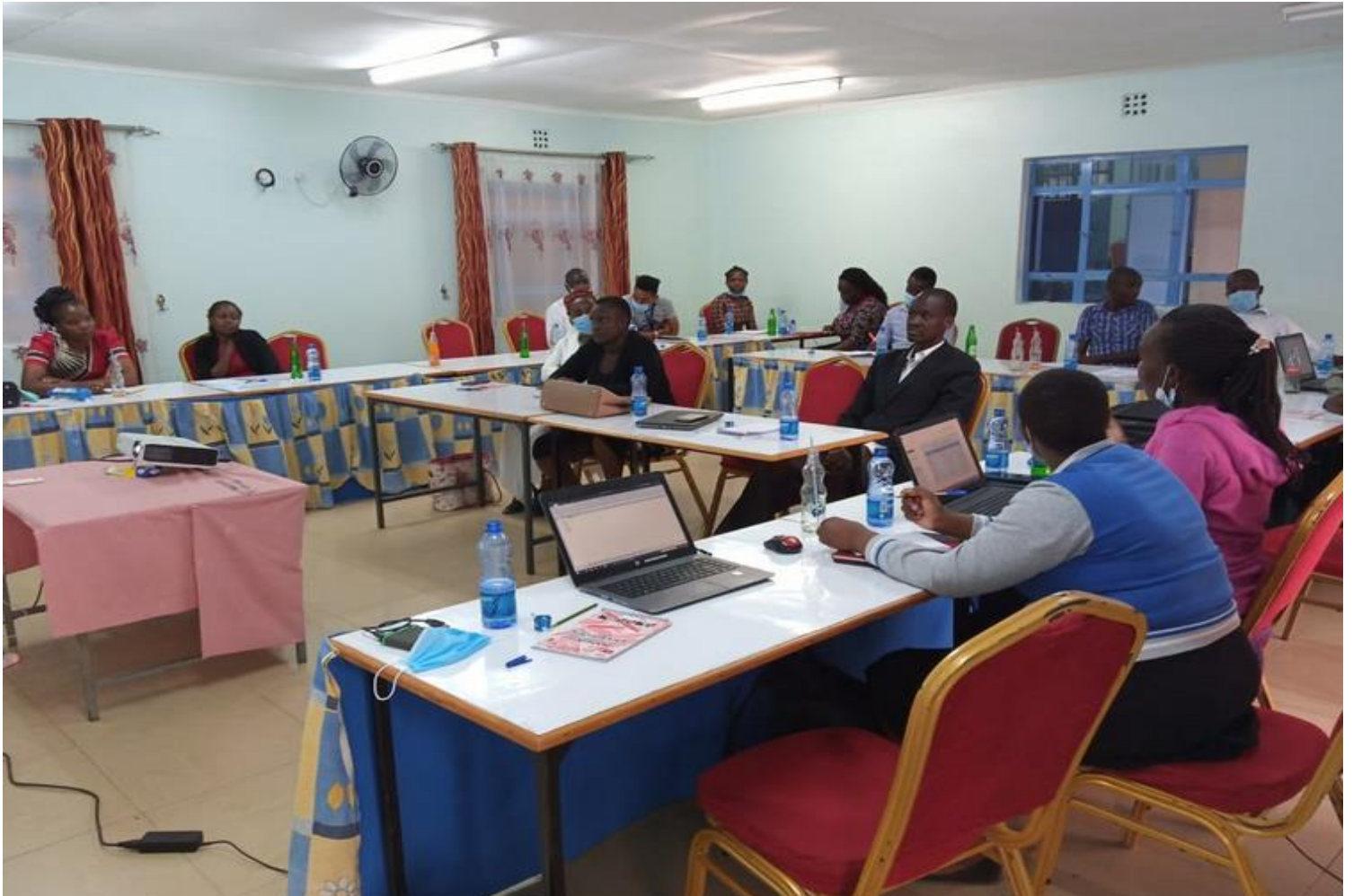
Technical working Group Meeting, Kakamega KANCO DICE