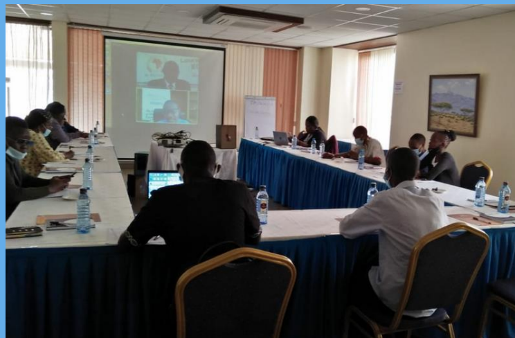
Nonstate actors meeting hosted by kanco AT Monarch Hotel

Africa is home to 16% of the world's population. The continent accounts for 26% of the world's disease burden yet receives just 1% of global health spending. As a result, 11 million Africans are falling into poverty every year due to high out-of-pocket health