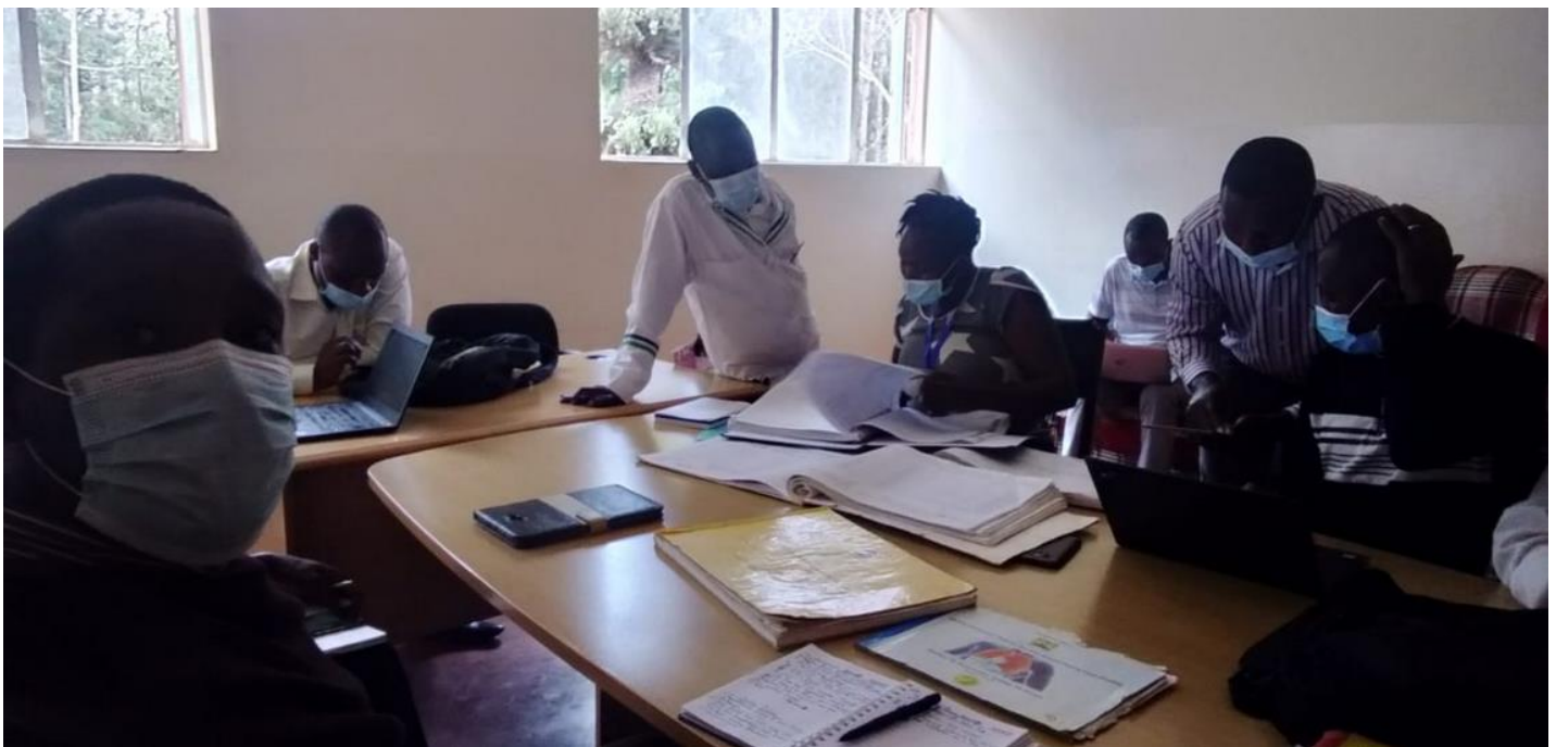
Onsite TB Data Verification with KANCO, the TB Programme and AMREF Health Africa Team., in Kutui County. Kitui is one of the counties where KANCO has been implementing the Global Fund TB project with the support of AMREF