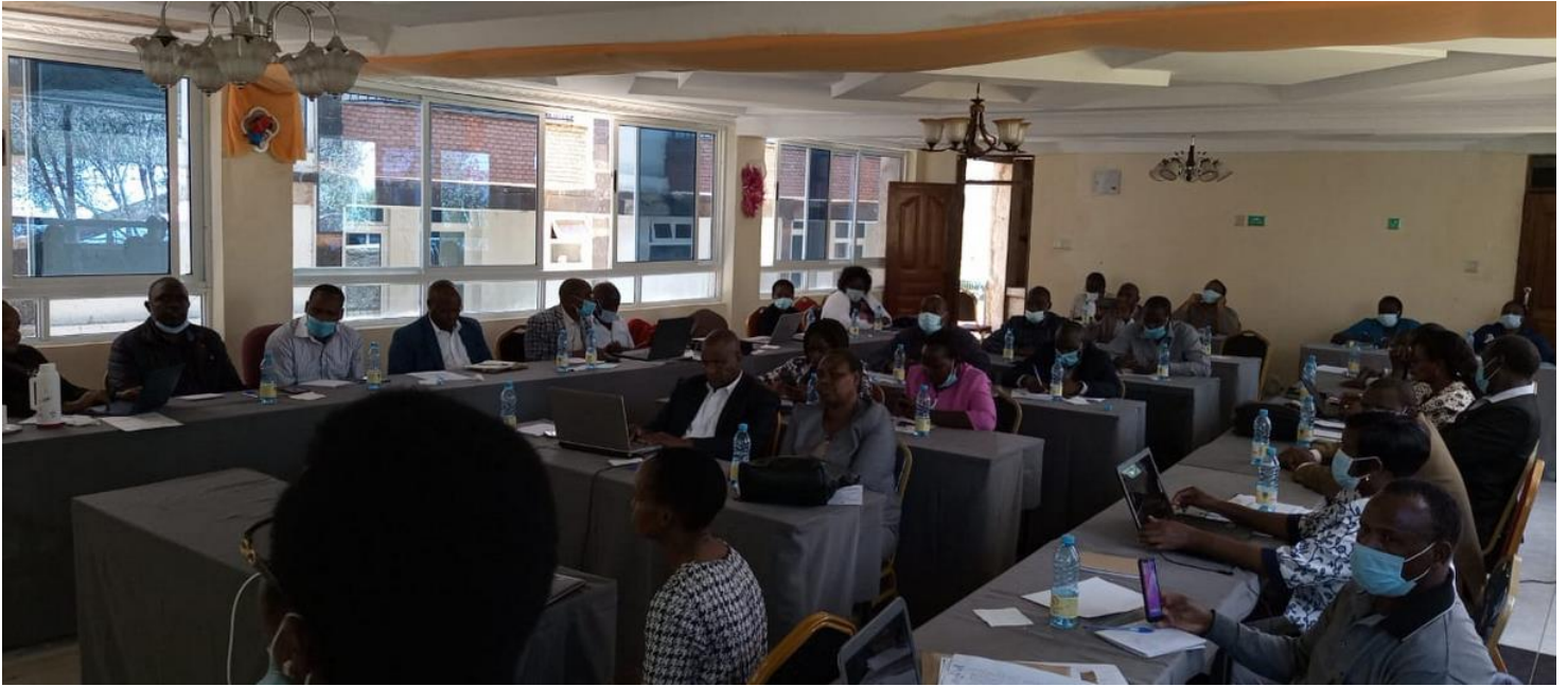
KANCO hosting an Expanded Immunization Programme meeting in Bomet County EPI