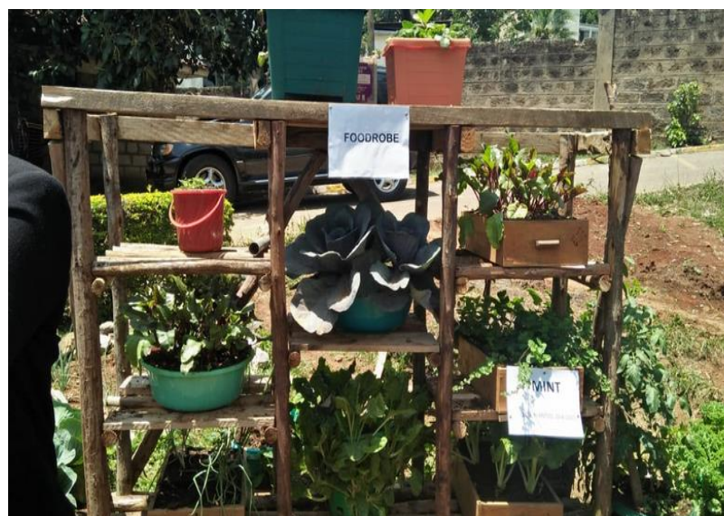
Sample Kitchen Garden

The kits comprise seed inputs of five types of vegetables (kale, spinach, black nightshade (manage), amaranthus (terere) and cowpeas seeds and solar driers to enhance the preservation of vegetables.