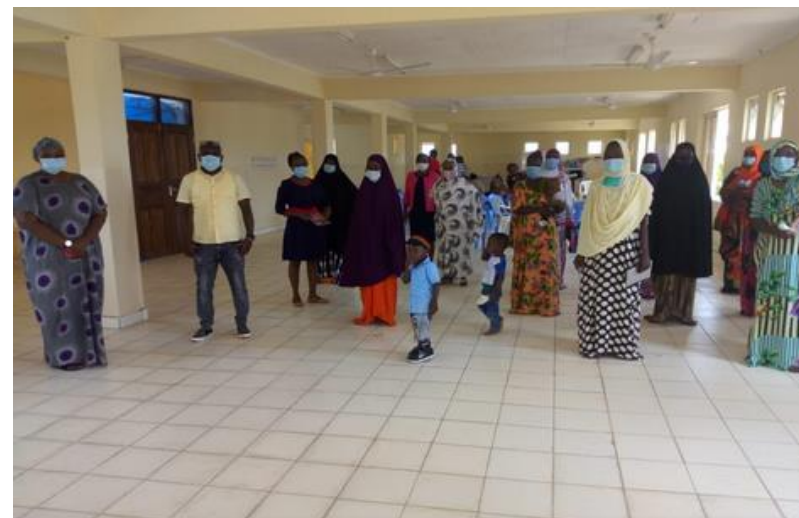
Representatives of the mother-to-mother support groups

Further, the mother to mother support group were hailed as having been key in the increased uptake of immunization services in the county.