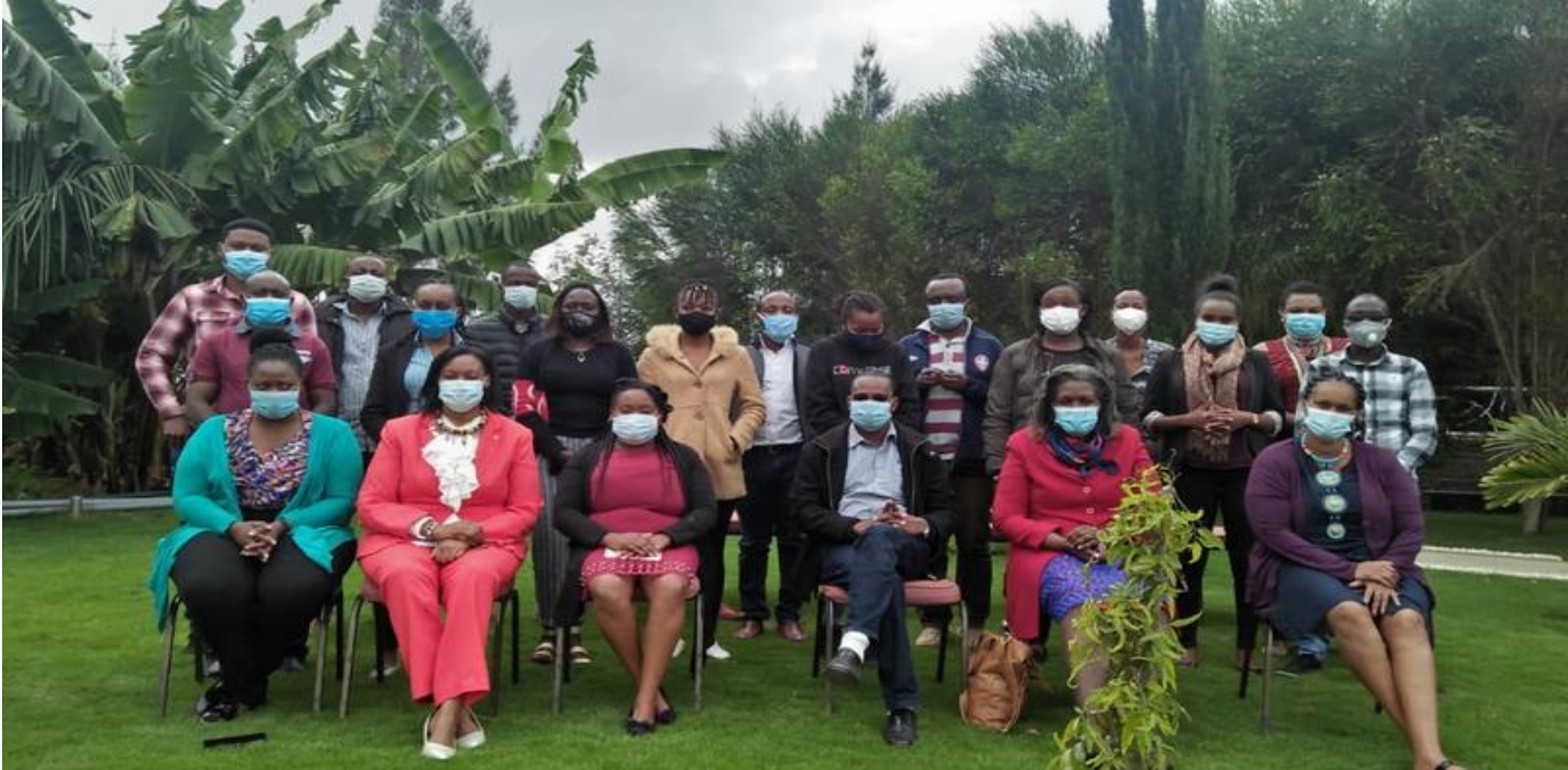
Kajiado Grassroots meeting on TB and Investments during COVID 19