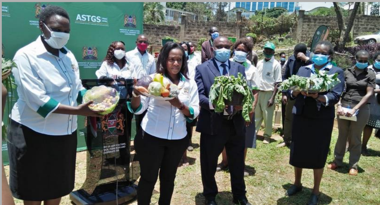
The CAS Ministry of Agriculture, Livestock and Fisheries and during the launch of the 1 Million Kitchen Gardens

Ahead of the nutrition symposium 2020, KANCO participated in the Launch of 1 million kitchen garden initiative for 47 counties officiated by the Cabinet Secretary for the Ministry of Agriculture, Livestock and fisheries Anne Nyaga.