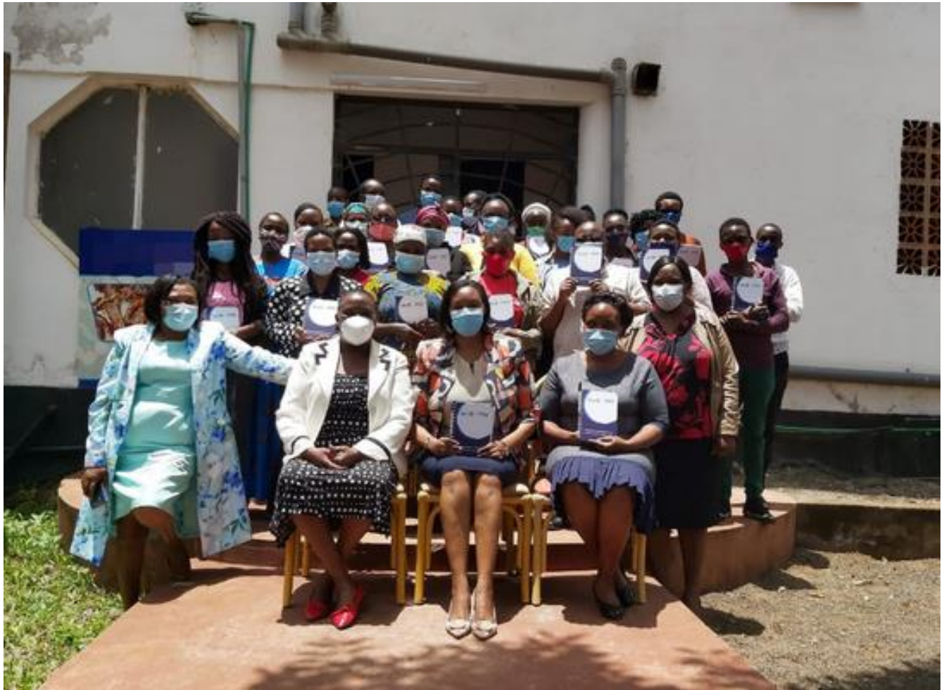
Kiambu County Grassroot during the meeting