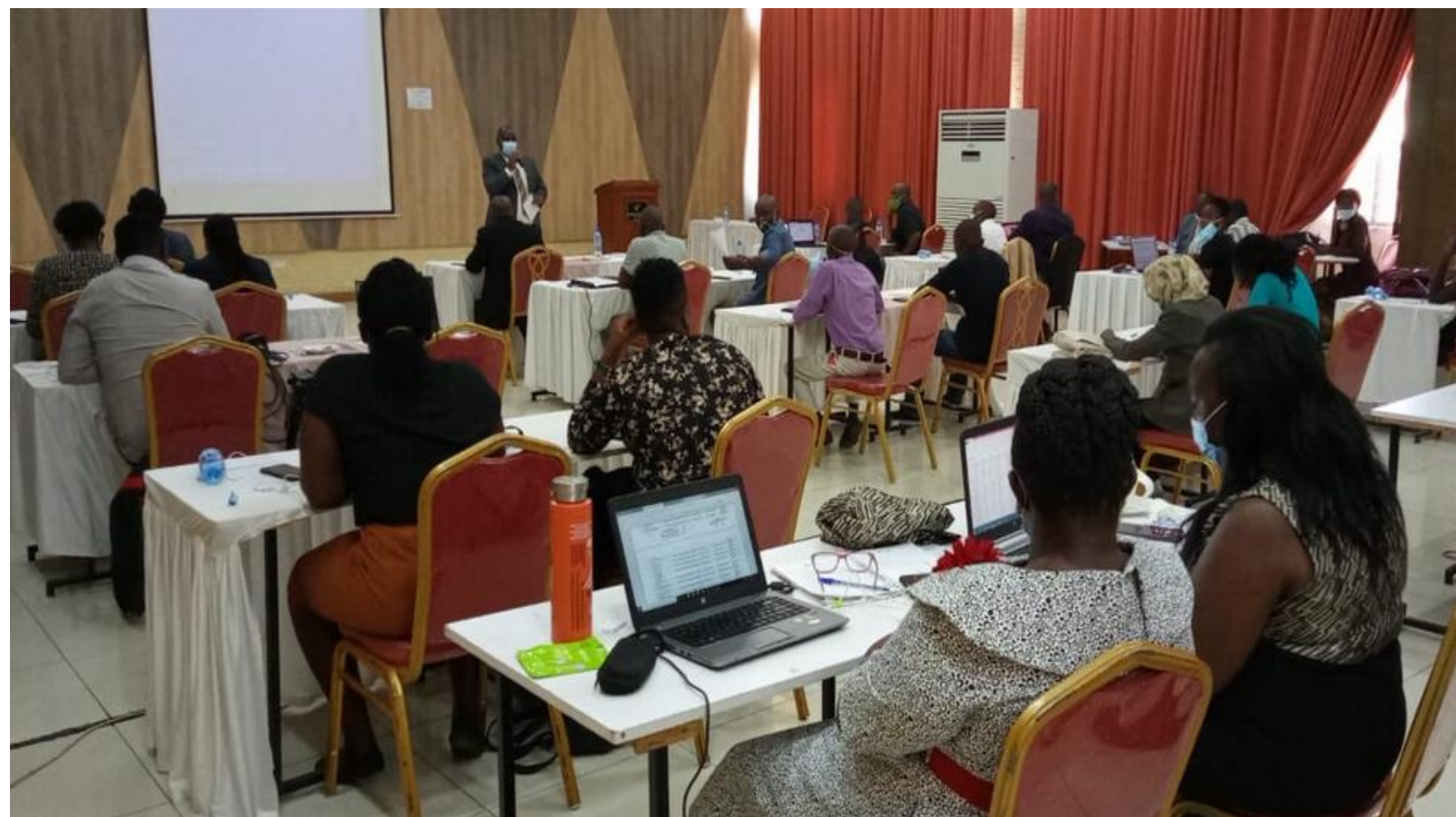
The County Health Management Team Meeting session held in Nakuru County

Between, 21st-23rd September, KANCO in partnership with the Department of Health services with the support of the GAVI/HSS project, hosted a meeting with the county health management teams, (CHMT) and the media to drum support for immunization. The meeting was also graced by the Chief Officer Public Health, County Nursing Officer and the County Head of Preventive and Promotive Health