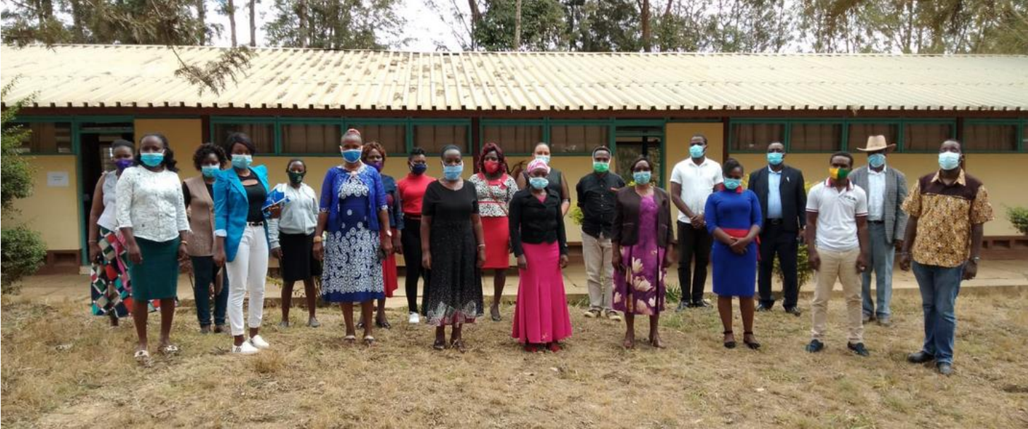
Grassroots meeting on immunization demand creation in Kajiado County hosted by KANCO