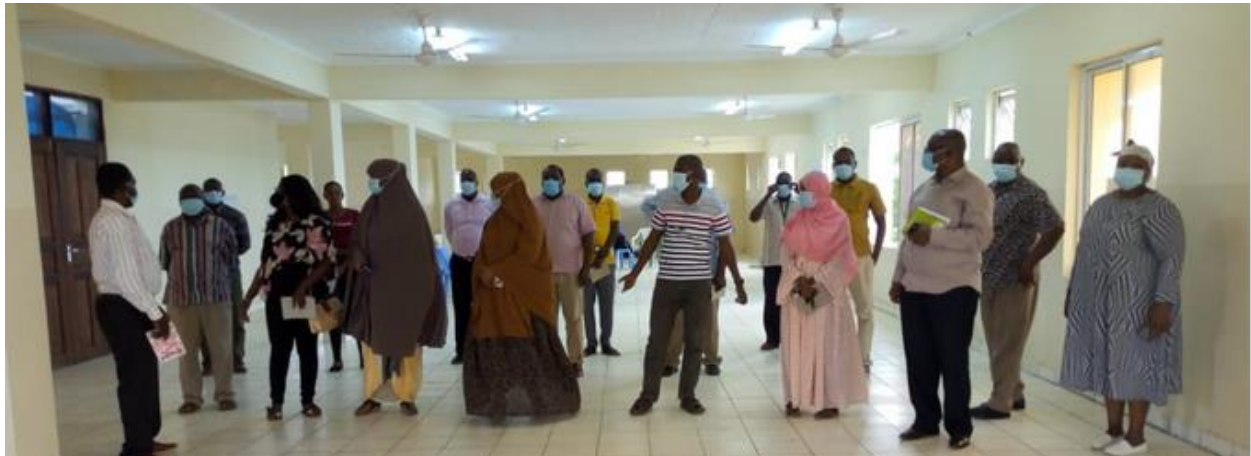
Tanariver County Members of the County Assembly

KANCO hosted a Members of the County Assembly (MCAs) meeting in Tanariver County, one of the counties where KANCO has been implementing the GAVI/HSS project that seeks to improve immunization outcomes across 17 counties. The meeting sought to support the development of a community health services bill to support health service delivery at the community level by Community Health Volunteers (CHVs) in the county.