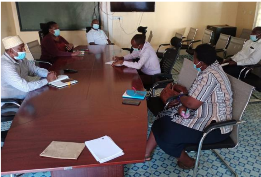
Isiolo County Health Management Team meeting with the KANCO team