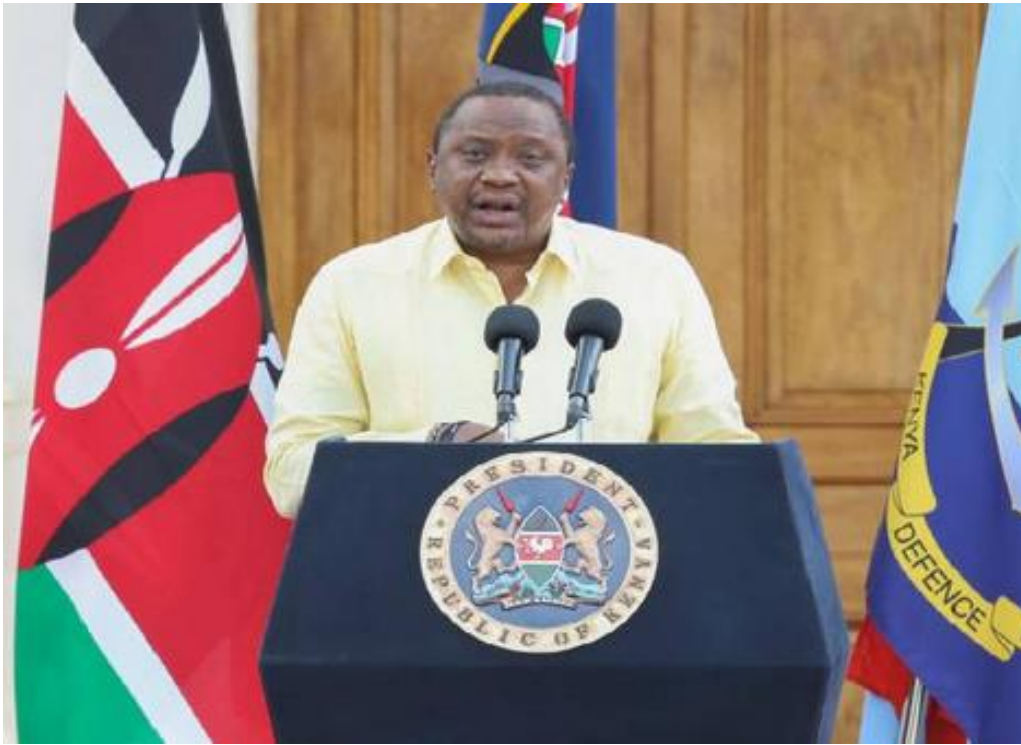
Photo Courtesy: H.E Uhuru Kenyatta Making remarks during the conference

On the 31 of August, President Uhuru Kenyatta lead a COVID-19 virtual conference themed ' County government resilience in the Covid 19 Era: building sustainability for the future '. The Conference brought together stakeholders including the council of governors, government agencies and non-state actors including KANCO to reflect on the country response to the pandemic and explore ways to build a sustainable future as the government executes a recovery plan.