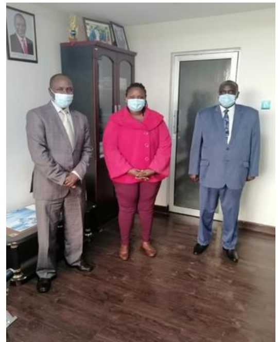
Feedback between KANCO and the Health Management team representatives Meru County