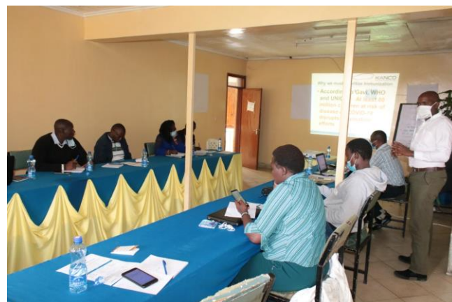
A training session during the Baringo County Training

Concern is growing the number will increase because coronavirus will likely to disrupt vaccination efforts and surveillance of vaccine-preventable diseases thus the efforts by stakeholders including KANCO.