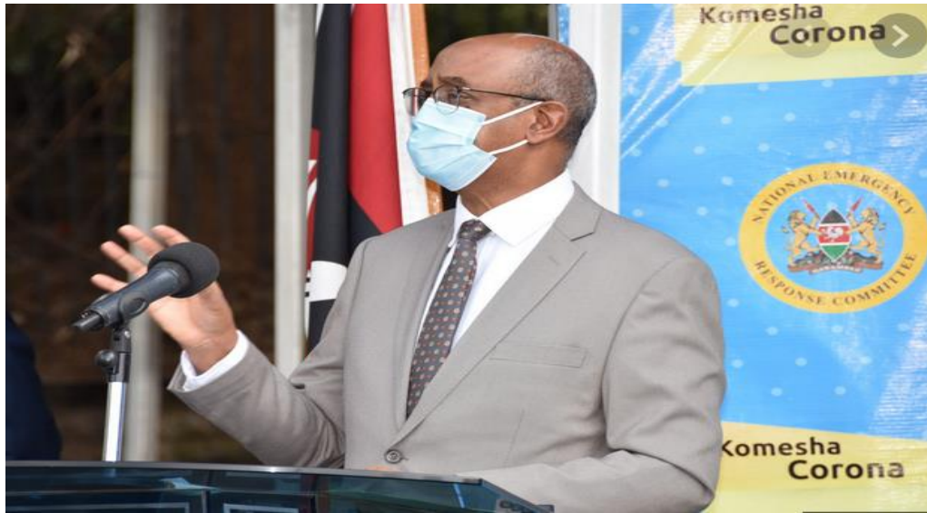
Photo Courtesy: CAS Health, Dr. Rashid Aman, during the Launch of New TB Drug Regimen

Tuberculosis (TB) is an airborne bacterial infection and is among the world's top infectious diseases, killing 4,000 people each day, and nearly 1.5 million each year. In Kenya there are 169,000 people in Kenya each year and is the fourth leading cause of death, killing nearly 29,000 people annually.