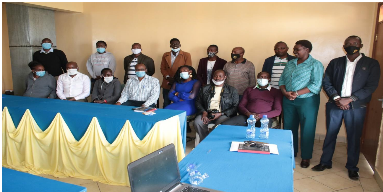
Media Training in Baringo County

KANCO has been carrying out a series of sensitizations for immunization towards the increased uptake of immunization that has been adversely affected by the advent of COVID. These sensitizations have been targeting community health care workers and media, as key influencers in the uptake of immunizations. Last week KANCO held media sensitization forums in Baringo County, bring together media practitioners and the ministry of health officials for discussion around immunization.