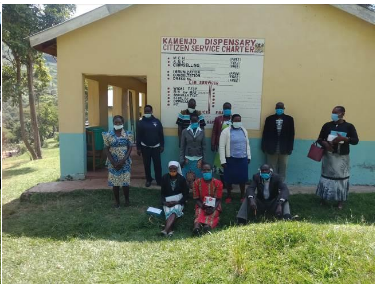
PPE Distribution at Kimalewa H/C, Kabuchai and Kamenjo Dispensary in Mt. Elgon Sub Counties