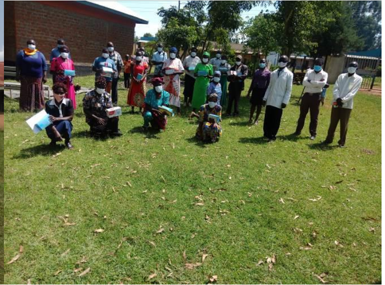
PPE Distribution at Ngalasia Dispensary, Kabuchai and Kibisi Dispensary in Tongaren Sub Counties