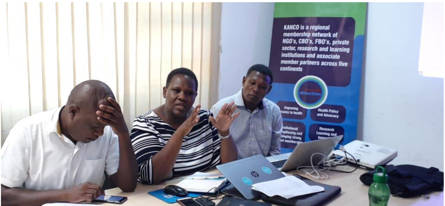
KANCO Campaigns Manager and the Kilifi County CHMT during the first meeting towards the development of the County DRM Strategy