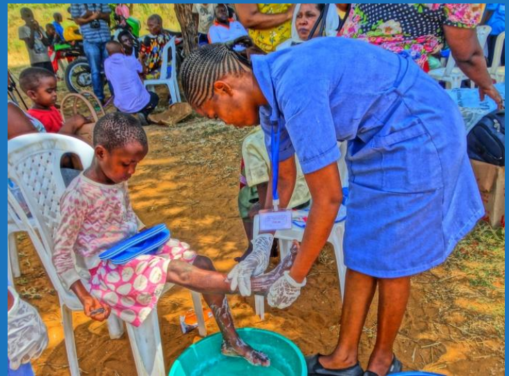
A Nurse Offering Services to A Young Girl during the National Jigger National Awareness Day in Kilifi County