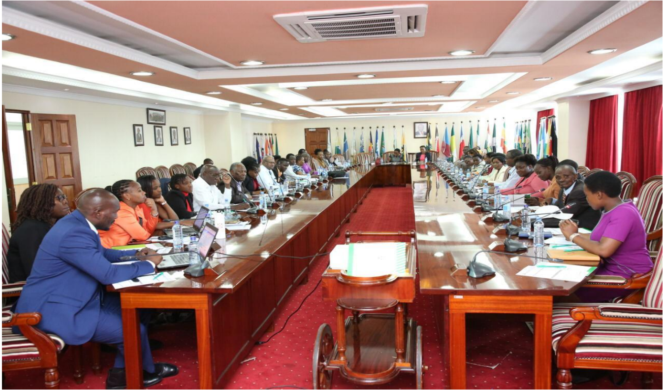
Multi-sector; delegation during the roundtable discussion

The annual devolution conference is set to be held in April 2020, with this year's theme being Multi-level governance for climate change and a sub-national theme: Subnational mobilization in unlocking the full potential of climate action . This is towards strengthening sub national governments to act on climate change and develop stringent mitigation capacities through increased resilience and response to climate change.