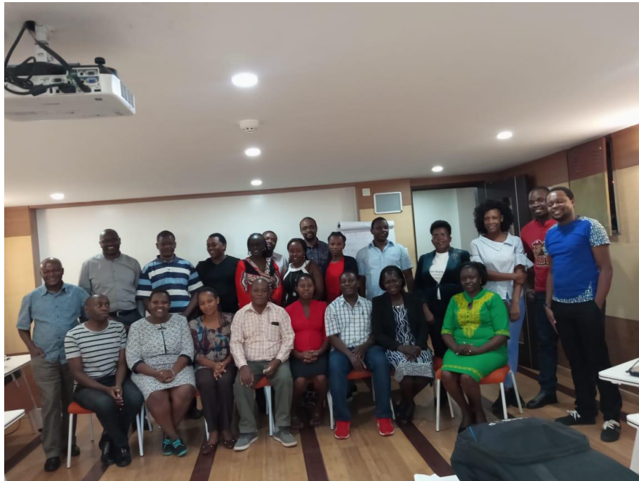
Stakeholders during the Viral Hepatitis Workshop convened by NASCOP

Kenya is endemic for hepatitis B and C viruses and despite there being an existing guideline for treatment, prevention and control as well as data on the burden of hepatitis B and C, a strategic plan has been missing to standardize implementation.