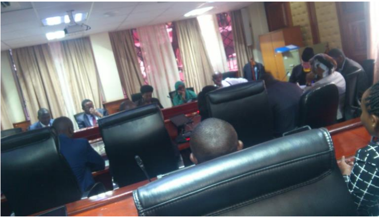
Various stakeholders make their case to the Senate Financing Committee during the submission of the BPS Analysis

The discussion also focused on the Universal Health Coverage country priorities before 2022, looking at the state of National Health Insurance Fund (NHIF) that is not accessible for majority of the ordinary citizens, with over 70 percent of the resources going to the private sector.