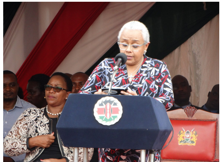
H.E the First Lady making remarks during the conference

In the fifth edition of the beyond zero safaris launch, KANCO partnered with Nairobi County in support of the first lady Beyond Zero Initiative to offer immunization and child health services during the three day medical camp running from the 22 nd -24 th January 2020. Beyond zero is a charitable organization providing free medical services across the 47 counties. Addressing the forum, the First lady reiterated her commitment to supporting the health cause and in particular meeting the World Health Organization (WHO) target of eliminating mother-to-child transmission of HIV and Syphilis. She added that Universal Health Coverage (UHC) remains a priority delivered through people centered quality care. She ap-