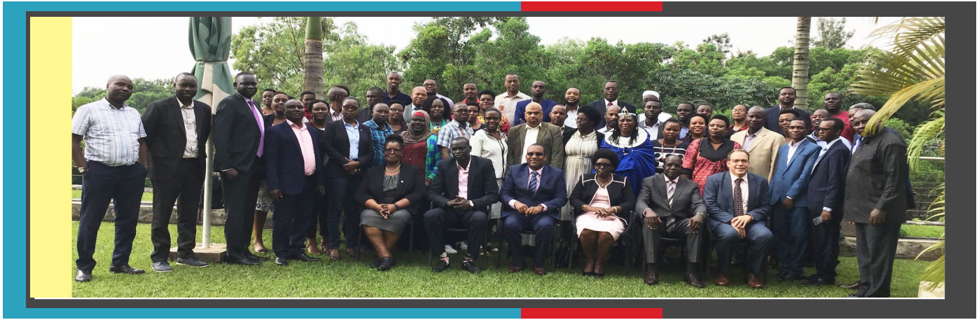
EALA and CSOs representatives during the forum delegation facilitated by EANNASO

Following an invitation from the East African Legislative Assembly (EALA), the Eastern Africa National Networks of AIDS and Health Service Organizations (EANNASO), organized a one day CSO meeting and a day EALA legislators orientation meeting at Kiriri Garden hotel on 23 rd January and 24th and 25th January respectively 2020 in Bujumbura, Burundi. The meeting aimed at discussing the Sexual and Reproductive Health Bill in the East Africa Community region.