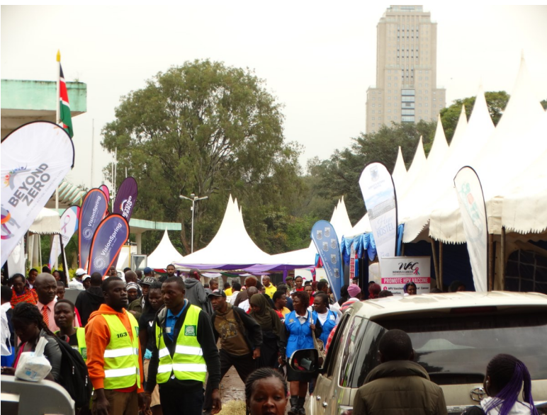
Nairobi County residents seeking different health services during the Beyond Zero Safari Launch event