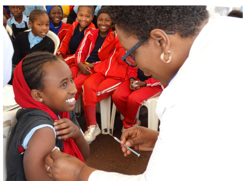
A ten year old receiving a HPV jab during the event