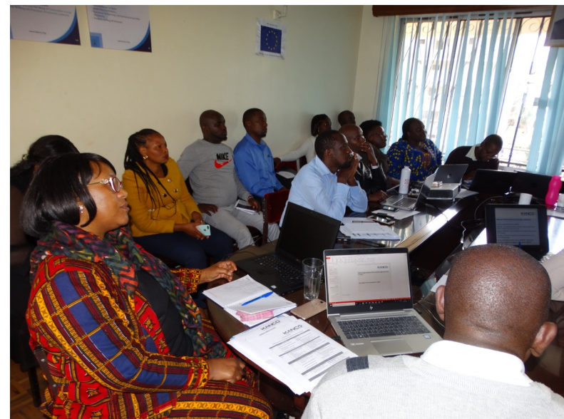
KANCO staff during a project performance presentation during the meeting