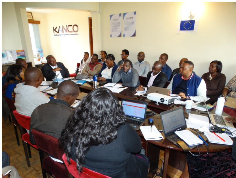
The Executive Director KANCO addressing KANCO staff during the meeting