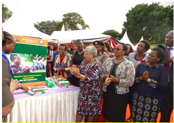
Her Excellency the First lady Margaret Kenyatta and the CS Health Sicilly Kariuki and accompanying delegation visiting the Nairtobi County Immunization stand during the Beyond Zero