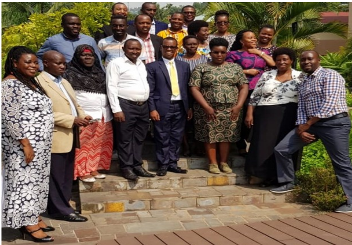
CSOs representatives during pre EALA engagement

EANNASO Board Chairperson addressing the forum stated 'Adolescents Girls and Young Women are 3 times more likely to