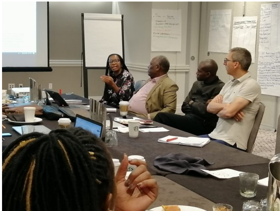
ACTION Africa team , holding a side meeting during the conference

The platform also provided an opportunity for advocates from across the world to share their experiences and stories around different areas: From how poverty blooms in silence, racial inequality and housing crisis, to the health, nutrition and child health