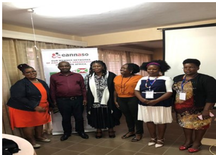
Photo: Members of EANNASO in the photo from left EANNASO Executive Director and Rwanda, Tanzania, Uganda, South Sudan and Kenya Representatives

KANCO supported EANNASO (The Eastern Africa National Networks of AIDS and Health Service Organizations) to convene a workshop on SRHR (Sexual and Reproductive Health and Rights) related legal and policy audit findings for East Africa that took place in Nairobi, at the Olive Gardens Hotel from 4th (Thursday) to 5th (Friday) July, 2019. The 31 workshop participants included representatives of regional and national Civil Society Organizations (CSOs) working on SRHR in East Africa.