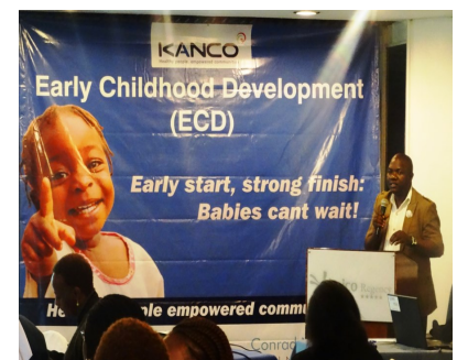
KANCO's systems strengthening advisor making a presentation during the ECD stakeholders forum in Nairobi

Information sharing and dialogue with the media and other stakeholders on the importance of National and regional advocacy to promote resource allocation towards ECD