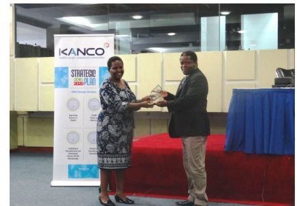
KANCO TB advocacy manager presenting an award to an MP representative during the meeting