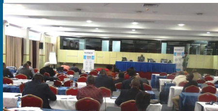
MPs representing different countries attending the TB side meeting during the ACP-EU meeting

During the 32 nd Session of the African Caribbean Pacific-European Union ACP-EU Joint Parliamentary Assembly held between the 19 th to 21 st December 2016 in Nairobi (Kenya), KANCO in collaboration with Global Health Advocates (GHA) Stop TB partnership and World AIDS Campaign (WACI) held a side event to sensitize the MPs from across the African region on the effects of Tuberculosis (TB) on development with political commitment to ending TB. This provided an important opportunity for the political leaders to discuss TB issues and take informed