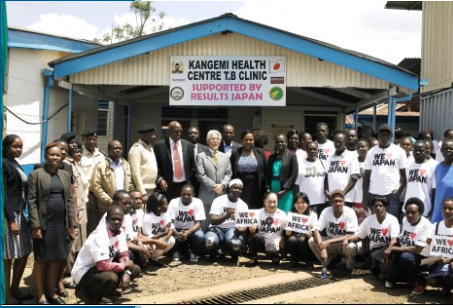
Stakeholders pose for a photo during the launch of facility handover ceremony

Upon the completion of renovations at the Kangemi Health TB Clinic, KANCO supported and participated in the Multi-stakeholders meeting / Handover ceremony. The meeting brought together key partners including RESULTS Japan, KANCO, Division of TB, Nairobi County Health Department, Malteser International, Private sector and Community health Volunteers from Kangemi region.