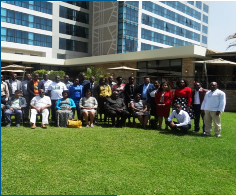
Country delegates from the Eastern Africa region attending the Regional consultative forum on harm reduction in Arusha

According to UNODC, there is an estimated 256 million people globally who use illicit drugs, with about 1.65 million of these being people who inject drugs and living with HIV. The Eastern Africa