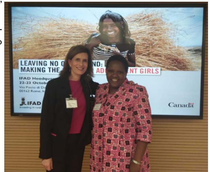
Campaigns Manager KANCO with her Royal Highness Princess Marie Esmeralda of Belgium at the IFAD conference in Rome

The conference focused on interventions and holistic approaches to fight against early marriage and early pregnancies, with special attention to youth empowerment initiatives, considered through a nutritional lens. This is in addition to sustaining on-going momentum of identifying solutions to break the intergenerational cycle of malnutrition, and to contribute to the achievement of the global nutrition goals and objectives of the United Nations Decade of Action on Nutrition.