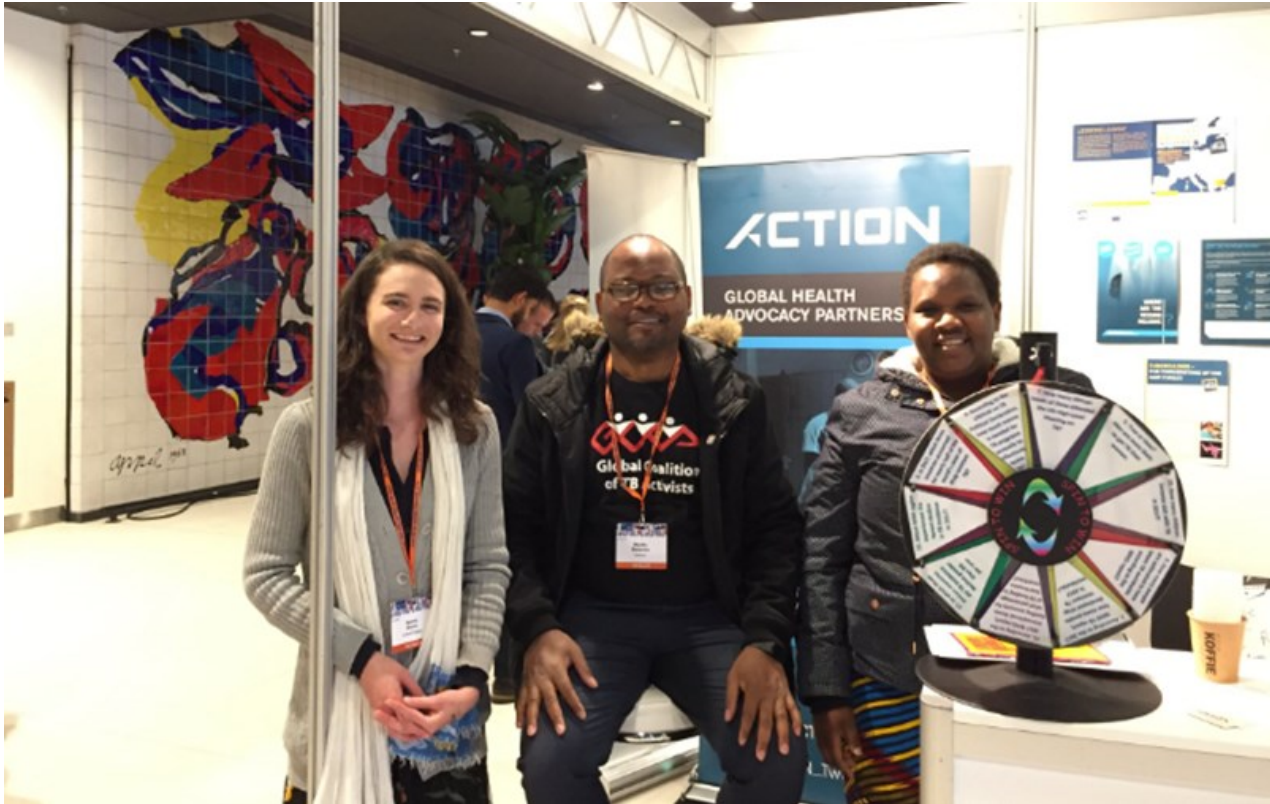
KANCO Campaigns manager with the ACTION team at the ACTION partners booth during the Union Conference, Hague, Netherlands

KANCO under the ACTION partnership joined delegates from across the globe at the 49th Union World Conference on Lung Health in The Hague. The four day conference held plenary discussions, symposiums and abstracts presentation focusing on both emerging science and the urgent political commitments to end TB. This was against the deliberations and discussions from the recently held first United Nations High-Level Meeting on tuberculosis (TB) in New York.