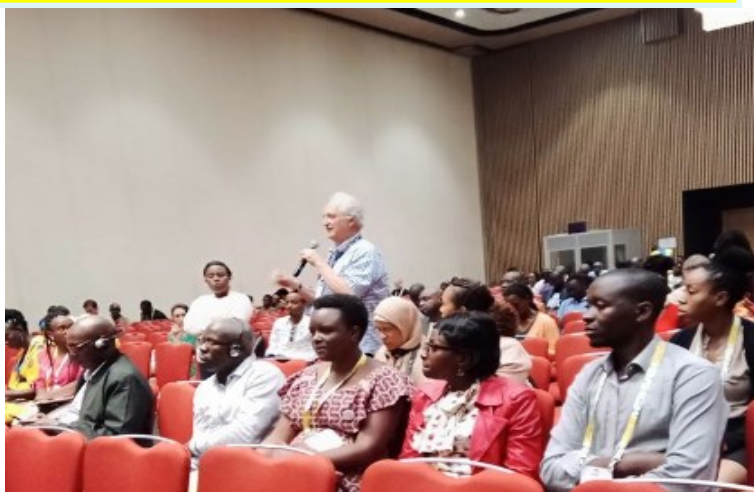
Stakeholders following and making contributions at the harm reduction side event