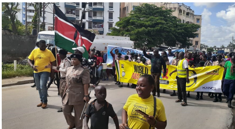
Mombasa County Celebrations procession