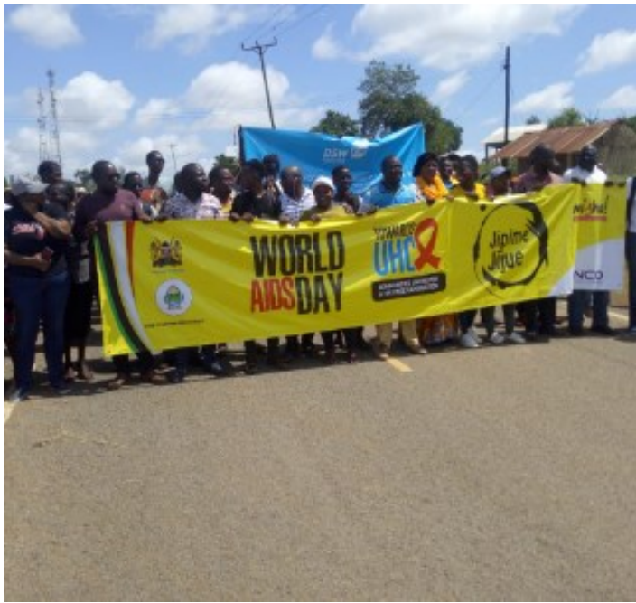
WAD2019 Procession in Kilifi County