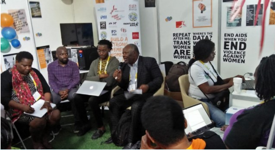
Stakeholders discussing the National Accountability Mechanism for TB /HIV in PEPFAR implementing countries.

KANCO participated in different sessions and thematic discussions and hosted two side events focusing on National Accountability Mechanism for TB /HIV in PEPFAR implementing countries and on harm reduction focusing on Harm Reduction Programmes in Africa Policies and Progress . The harm reduction session looked at the global and regional state of harm reduction, providing an opportunity to learn and share on policies and practice across the region as well as deliberate on the way forward for harm reduction in the region.