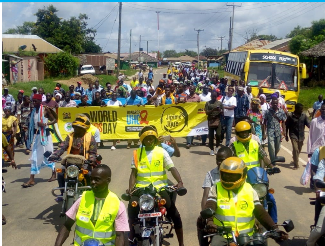
World AIDS Day 2019 procession in Kilifi County

KANCO joined the globe and the national stakeholders to mark the World AIDS Day under the theme global theme “ Communities make the difference ” and the national theme adopted from the global theme “ Towards UHC: Communities united for a HIV free generation ”. The celebrations were towards support to the people living with HIV and in remembrance of those who have succumbed to aids related illness. The year’s theme was in recognition of the role of the communities in the fight against HIV and AIDS and towards strengthening the role of stakeholders in the response by amplifying the voice of the communities, civil societies and grassroots actors to strengthen the fight against HIV and AIDS through advocacy for sustainable domestic funding for the response in the face of shrinking donor resources. The community led response remains critical to ensuring that no one is left behind, by galvanizing a people led and centered response.