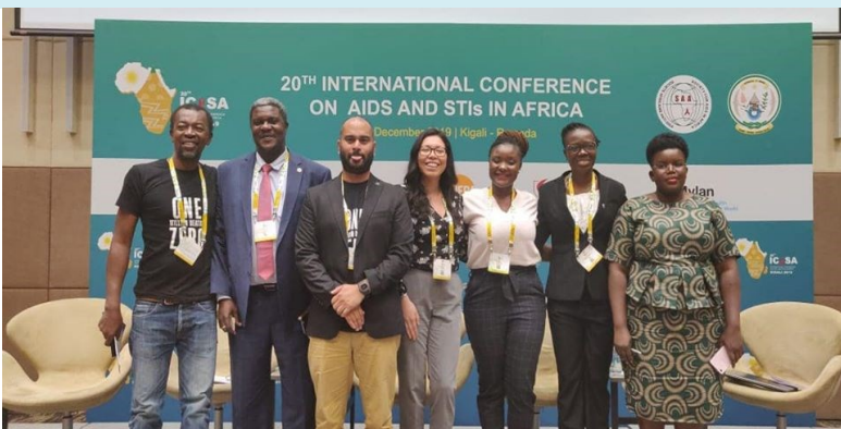
Panelists at the harm reduction Policies and Programs session hosted by KANCO and Pils-Mauritius