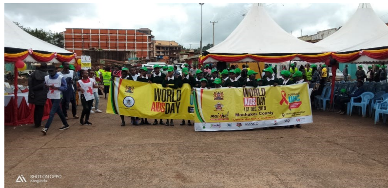
Machakos WAD 2019 County Syrup