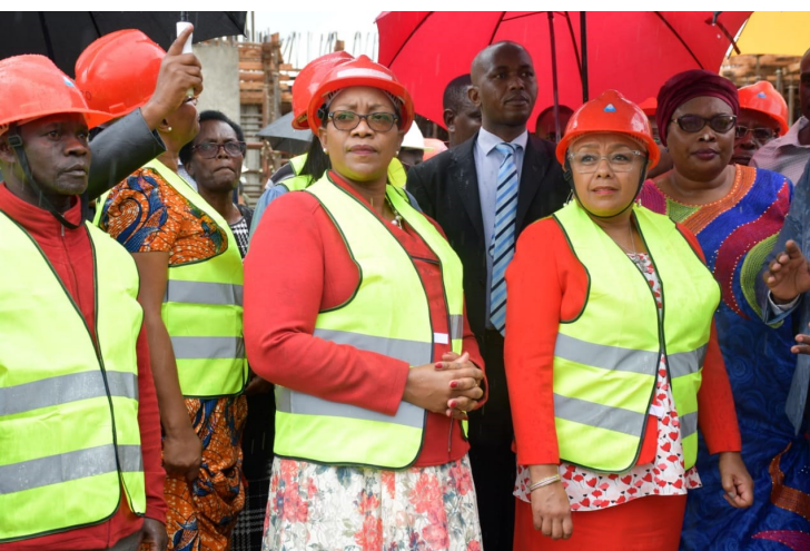
H.E the First Lady Margret Kenyatta and Health CS Sicily Kariuki among other delegates during the WAD 2019 national Celebration in Kisii County