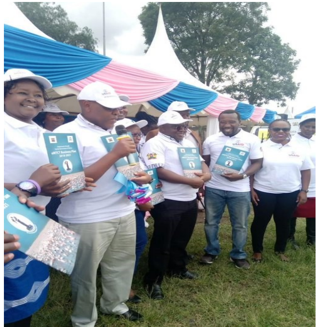
Nakuru County WAD 2019 celebrations and launch of the county EMTCT business plan