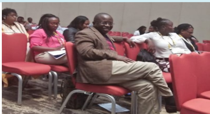
Member of Parliament and Chair of the Parliamentary Health Committee Tanzania, following the harm reduction session proceedings