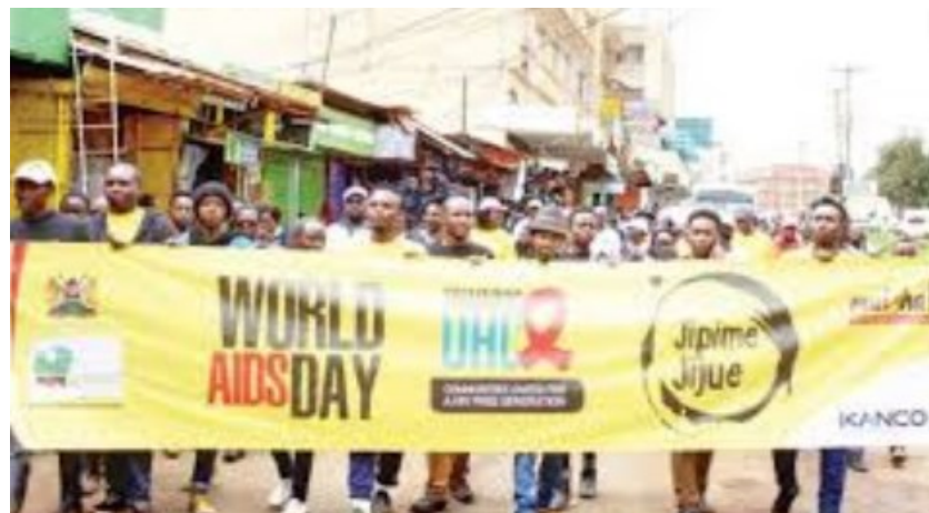
WAD 2019 National Celebration Procession in Kisii County