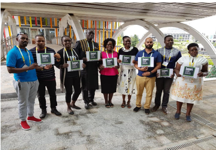
Harm stakeholders drumming support for the Support Don't Punish Campaign