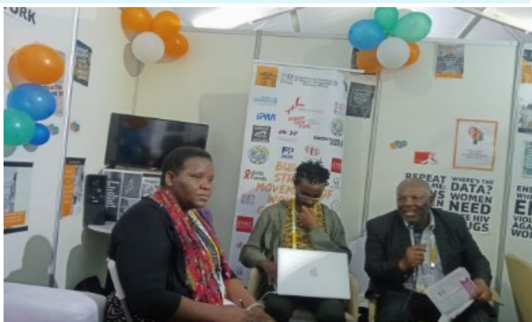
KANCO Executive Director Making a Contribution during the National Accountability Mechanism for TB /HIV in PEPFAR implementing countries, L- a participant during the session making a contribution.