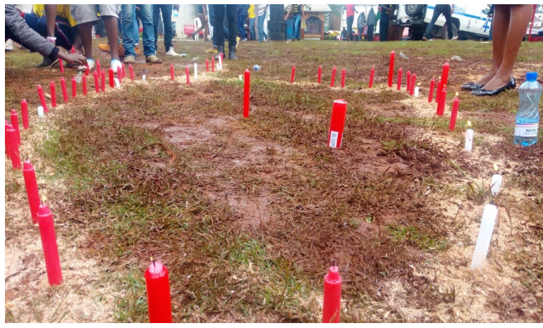
Candle lighting in memory of those who has succumbed to AIDS in Nyeri County