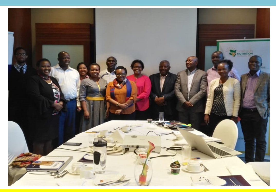
CSOs, Ministry of Health and Parliamentary representatives during the consultation meeting

KANCO in partnership with the SUN-CSA hosted a parliamentary and nutrition stakeholder's consultative forum ahead of the SUN Global Gathering to be held on the 4th October –7th November 2019. The stakeholders forum took place on the 24th October 2019 at the Intercontinental hotel Nairobi Kenya. The meeting brought together the Ministry of Health, CSOs representatives and Member of Parliament who would be attending the SUN Global Gathering, at Kathmandu, Nepal.