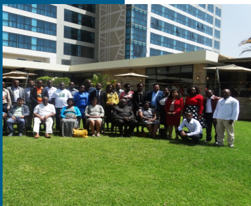
Country delegates from the Eastern Africa region attending the Regional consultative forum on harm reduction in Arusha

According to UNODC, there is an estimated 256 million people globally who use illicit drugs, with about 1.65 million of these being people who inject drugs and living with HIV. The Eastern Africa