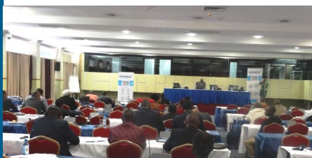
MPs representing different countries attending the TB side meeting during the ACP-EU meeting

During the 32 nd Session of the African Caribbean Pacific-European Union ACP-EU Joint Parliamentary Assembly held between the 19 th to 21 st December 2016 in Nairobi (Kenya), KANCO in collaboration with Global Health Advocates (GHA) Stop TB partnership and World AIDS Campaign (WACI) held a side event to sensitize the MPs from across the African region on the effects of Tuberculosis (TB) on development with political commitment to ending TB. This provided an important opportunity for the political leaders to discuss TB issues and take informed