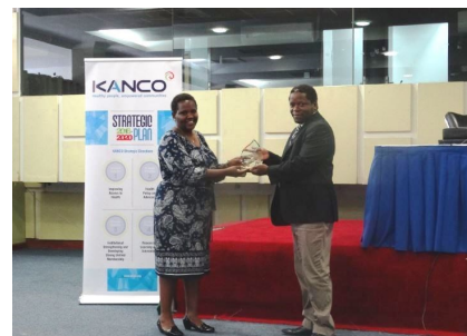
KANCO TB advocacy manager presenting an award to an MP's representative during the meeting