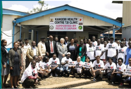
Stakeholders pose for a photo during the launch of facility handover ceremony

Upon the completion of renovations at the Kangemi Health TB Clinic, KANCO supported and participated in the Multi-stakeholders meeting / Handover ceremony. The meeting brought together key partners including RESULTS Japan, KANCO, Division of TB, Nairobi County Health Department, Malteser International, Private sector and Community health Volunteers from Kangemi region.