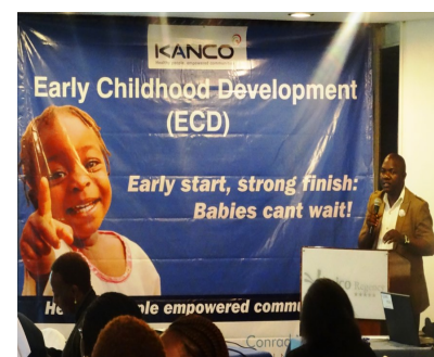
KANCO's systems strengthening advisor making a presentation during the ECD stakeholders forum in Nairobi

Information sharing and dialogue with the media and other stakeholders on the importance of National and regional advocacy to promote resource allocation towards ECD